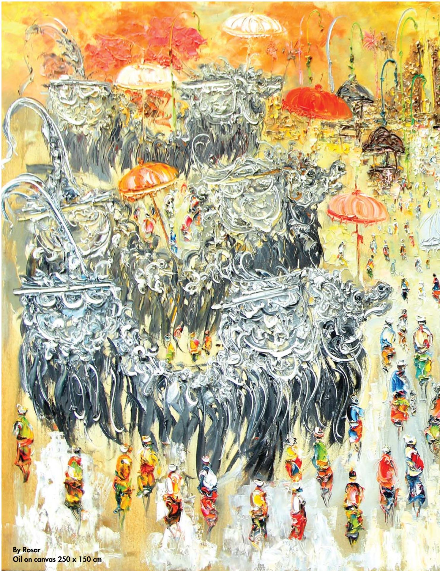
By Rosar Oil on canvas 250 x 150 cm