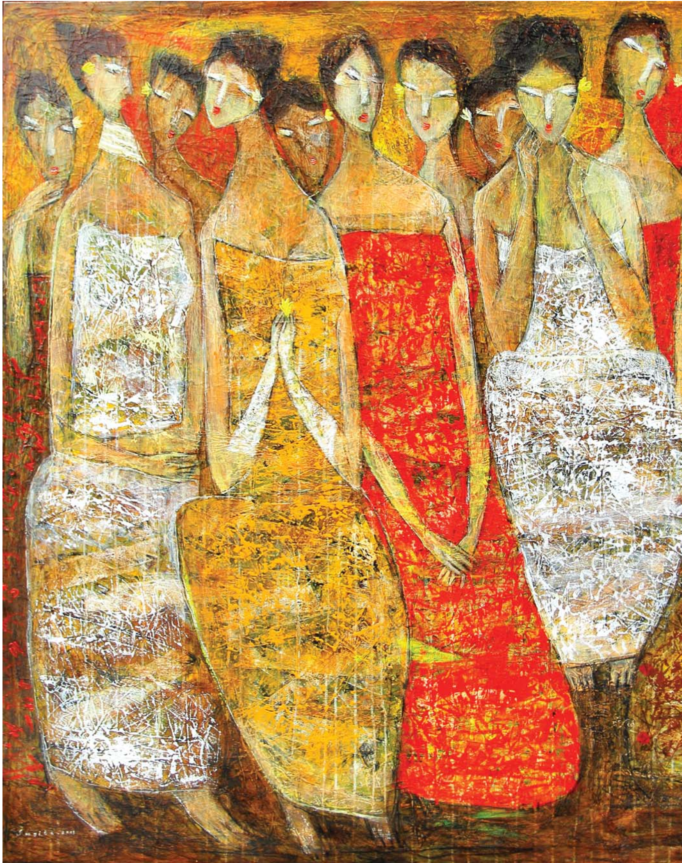
By Sugita Acrylic on canvas 150 x 150 cm