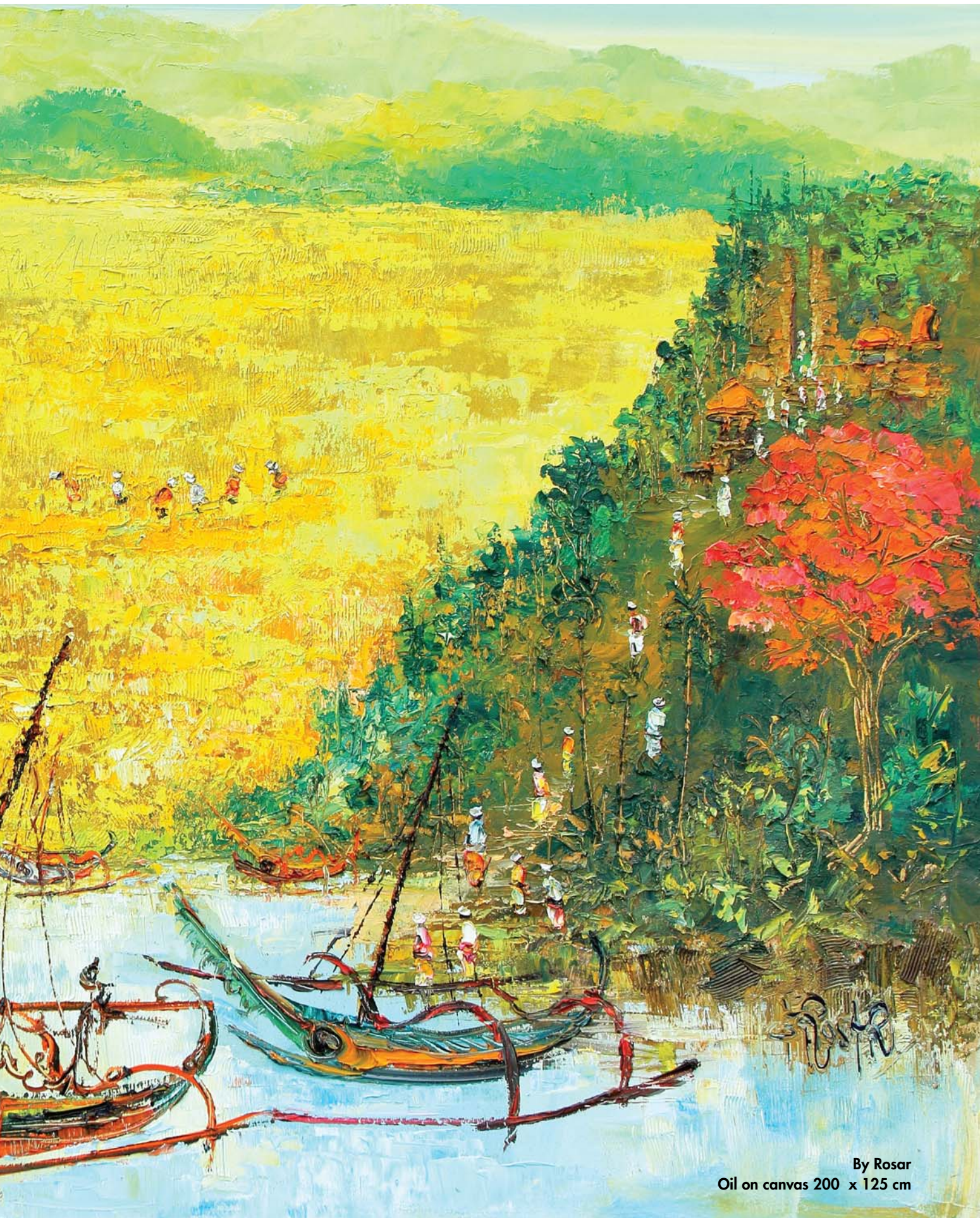
By Rosar Oil on canvas 200 x 125 cm