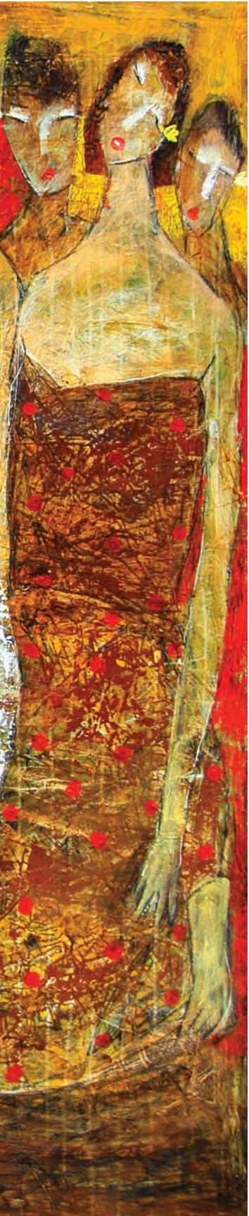
By Iman Ritma Acrylic on canvas 50 x 50 cm