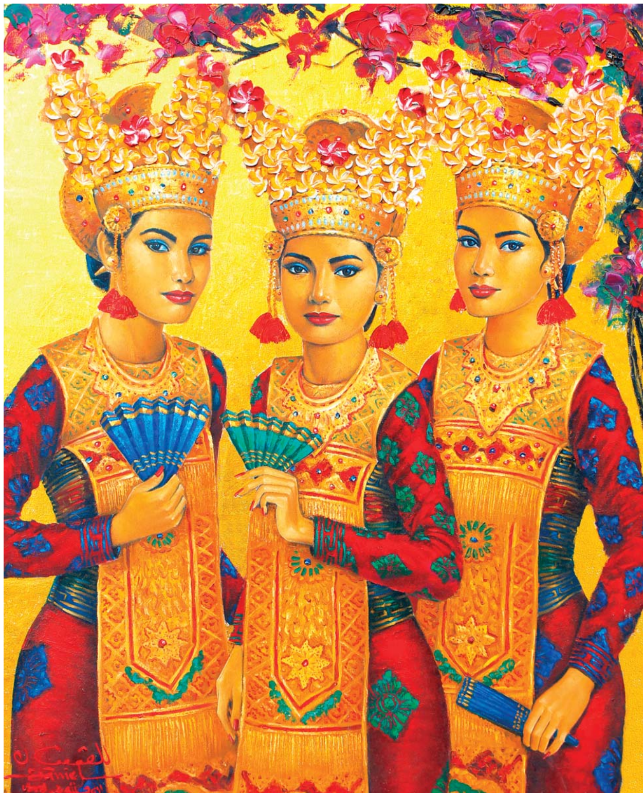
By Daniel Oil on canvas 150 x 120 cm